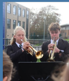
Remembrance Page 7