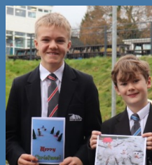
Christmas Page 2

Autumn Term: Edition 2 Friday 20th December 2024