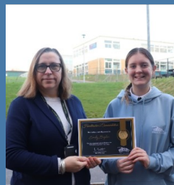
Commendations Page 6