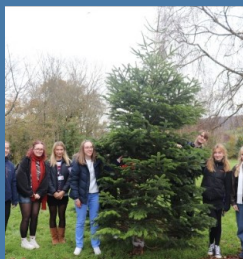
Tree Carry Page 3