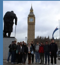
Politics Trip Page 9