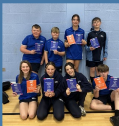
Sports News Page 5